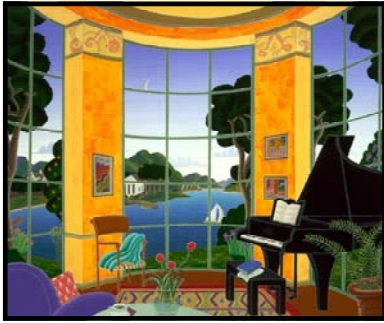
©2009 The Yellow Music Room