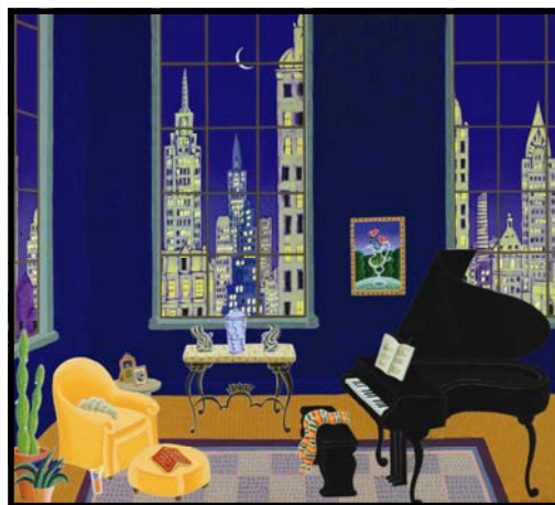
©2009, Thomas McKnight, Manhattan Nocturne, Silk-screen Print - all rights reserved courtesy of Thomas McKnight www.thomasmcknight.com

The concert will be about an hour long, without intermission, with a festive celebration afterward on stage. Season and individual concert tickets are now on sale at 541-915-5352. Student vouchers are also available for $5 tickets.