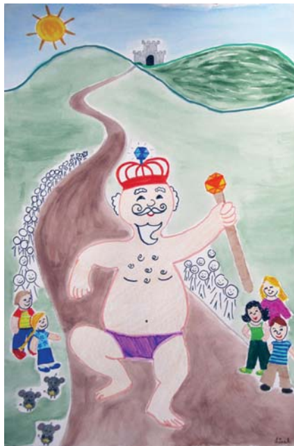
"The Emperor's Grand Parade" 2010 Liesl Benda age 10