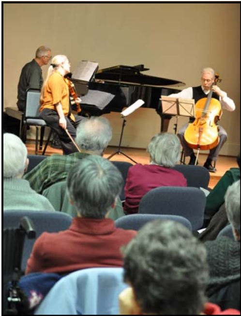
Cascade Manor, February 26, 2011 each concert.

This season Amici is giving free concerts for over a thousand kids at three public schools: Riverbend Elementary in Springfield, and Camas Ridge and River Road Elementary in Eugene. We are also collaborating with composition and music students at the Academy of Arts and Academics in Springfield, to perform their compositions with them in the Wildish Theater on June 7. Meanwhile, we have been giving free Saturday afternoon performances at Cascade Manor in Eugene before